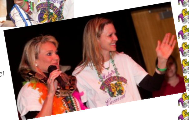
Petting of the Snake and the Alligator