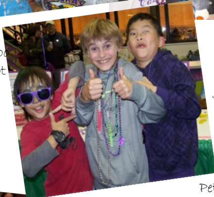
It was Superduperawesome!